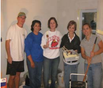
Clinton First Baptist Church hard at work painting the baby boutique.

As we continue to rely on the faithfulness of God, we are always amazed by the blessings that he provides for us. Whether it be through individual volunteers, volunteer groups, or financial help—God is so good. Thanks to many hands and helpers, we are finishing up the boutique project. Now the young girls who are part of the Earn While You Learn program (EWYL) have a great space at NewBeginnings when looking for much needed baby items. We have been blessed from the community with items to fill the boutique so the girls can receive new items for their babies. For more information on the EWYL program and upcoming group classes please contact our office.